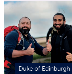
Duke of Edinburgh