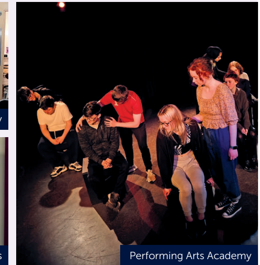
Performing Arts Academy