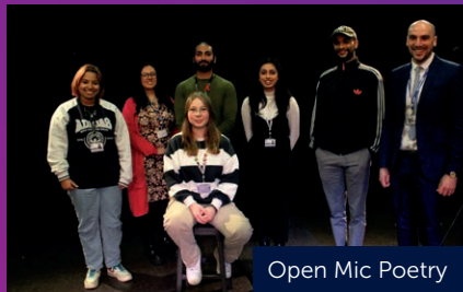
Open Mic Poetry