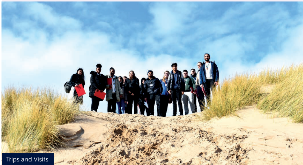
Trips and Visits