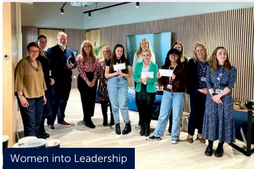
Women into Leadership