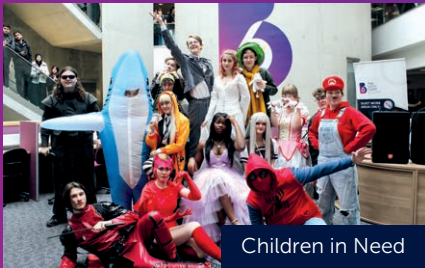
Children in Need

When students perform well in these areas, or make personal progress, they are awarded with B6 Coin in the relevant skill category. At the end of each term the 'richest' students in each category receive a B6 Rich badge, a certificate and a £50 voucher.