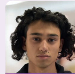
MEng Engineering Science